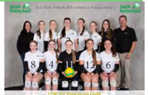
17W D1 Provincial Gold