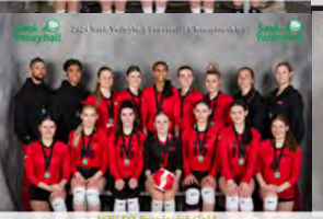
16W D2 Provincial Gold