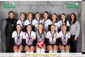
16W D1 Provincial Gold