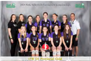
15W D1 Provincial Gold