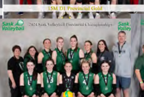
15W D1 Provincial Gold