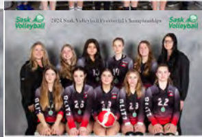
14W D3 Provincial Gold