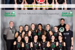
14W D1 Provincial Gold