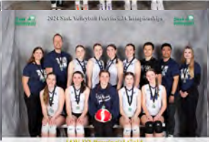
15W D2 Provincial Gold