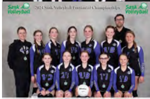
13W D2 Provincial Gold