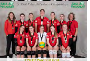
17W D2 Provincial Gold