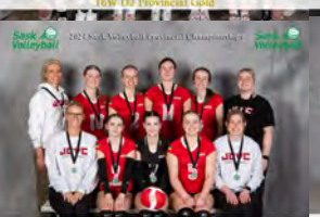
16W D3 Provincial Gold