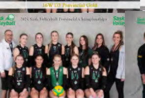
15W D2 Provincial Gold