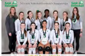
13W D1 Provincial Gold