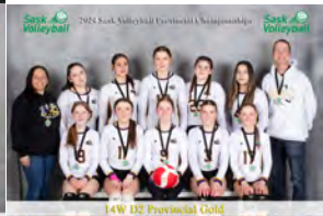
14W D2 Provincial Gold