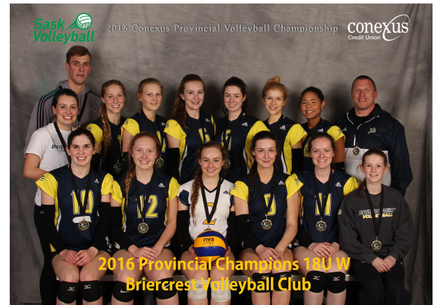
The Briercrest Volleyball Club (above), and Saskatoon Huskies VC Green (below), finished their volleyball seasons with 18U Provincial Championships.