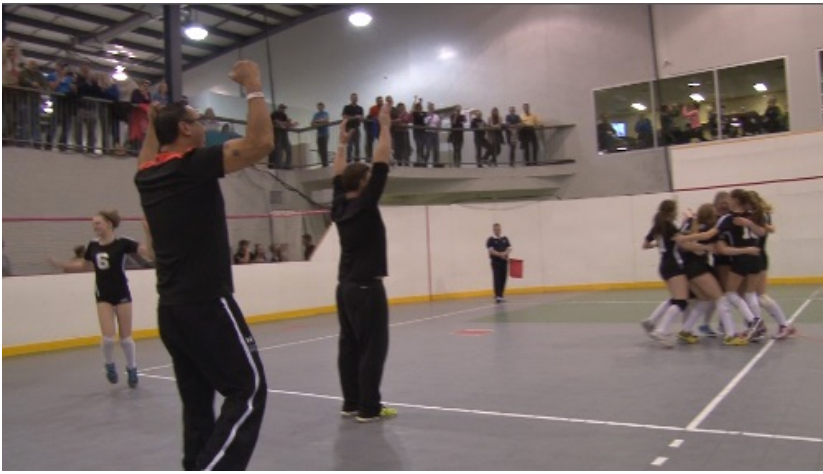
The 14U Women Prince Albert Optimist Toppers En Fuego (above) and the 16U Men Swift Current Junior Sundogs in action at the 2016 Conexus Provincial Volleyball Championships in Saskatoon.