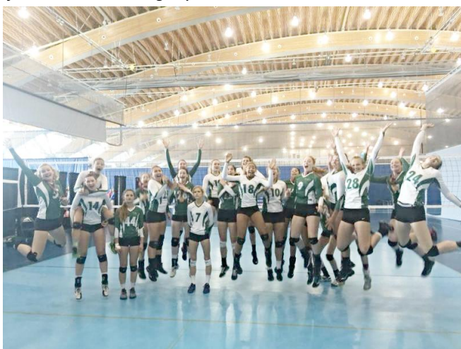
Team Sask Indoor Women's 17U and 18U teams achieved great results at the 18U NTCC in 2016. The 18U team won the bronze medal, the 17U finished 6th, and six girls were selected to the National Youth Development Team.