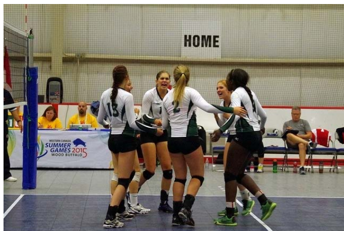
Team Sask Indoor Women 18U were one of three Sask teams to win medals at the 2015 Western Canada Summer Games.