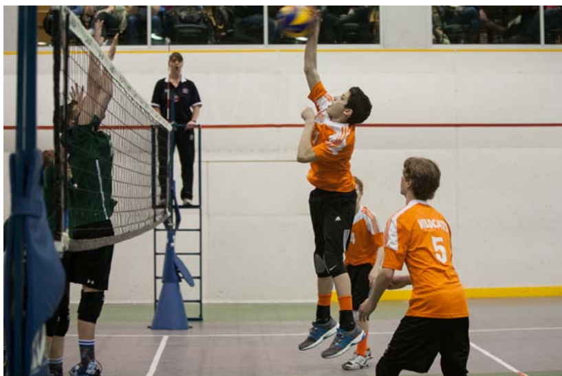
White City Wildcats in 14U Men action at the 2015 Conexus Provincial Volleyball Championships.