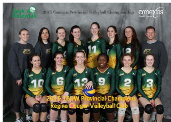
The Regina Cougars Volleyball Club (above), and Prince Albert NSVC Tigers (below), finished their volleyball seasons with 18U Provincial Championships.