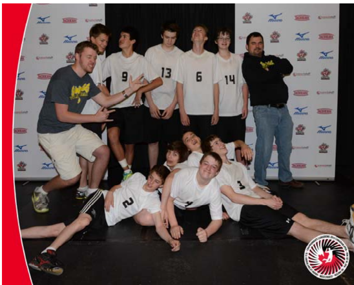
Swift Current Junior Sundogs boys team hamming it up at the 15U Canadian Open West in Regina.