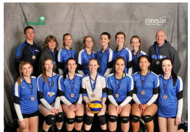
Both the Saskatoon Total Chaos (above) and Prince Albert Volleyball Club Smashing Bananas (below), finished off their club volleyball careers with 18U Provincial Championships.