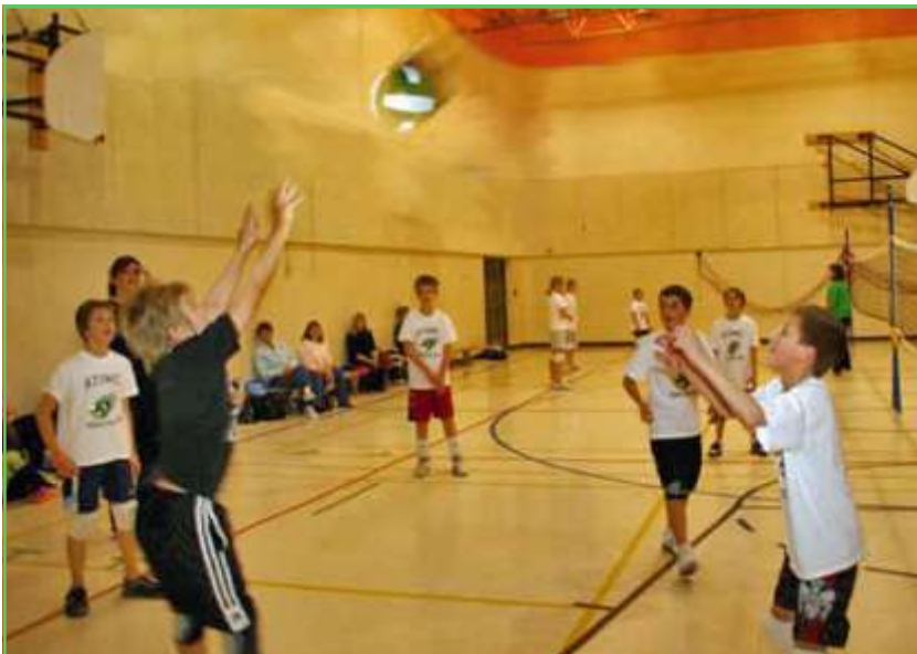
Atomic Volleyball program