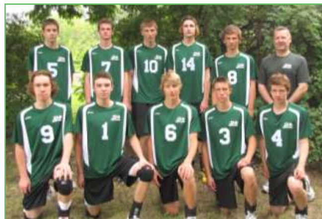
2012 17U Men's Green Team

Congratulations to the following Provincial Team Athletes: