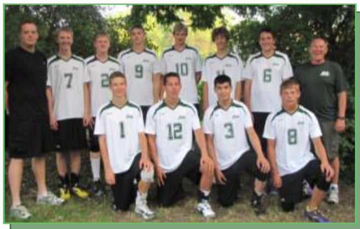
2012 17U White Provincial Team