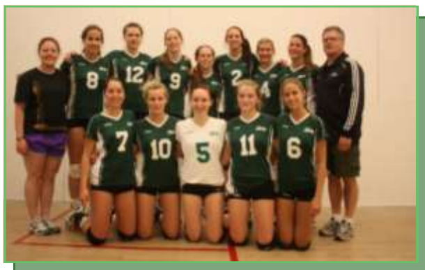
2012 16U Green Provincial Team